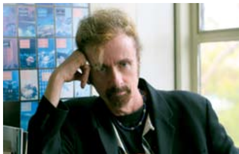
Author T.C. Boyle

Boyle will make two live appearances locally as part of Silicon Valley Reads: