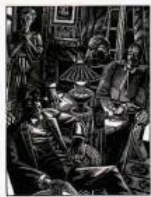
LONG DAY'S JOURNEY INTO NIGHT EUGENE O'NEILL